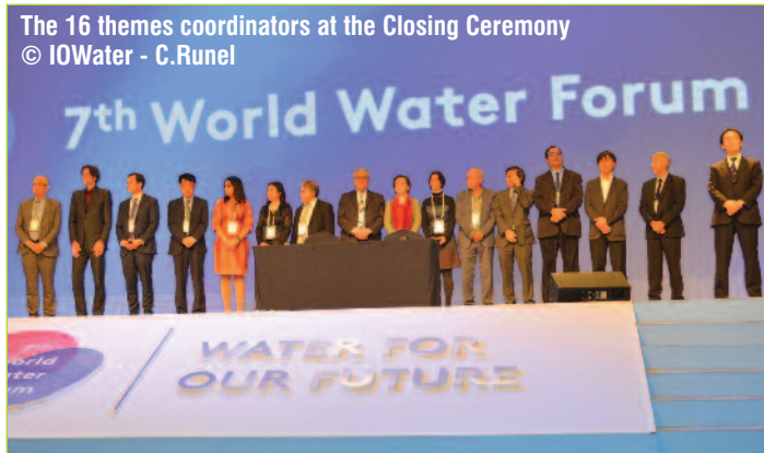
The 16 themes coordinators at the Closing Ceremony

"Integrated river basin management is crucial to ensure water resources sustainability"