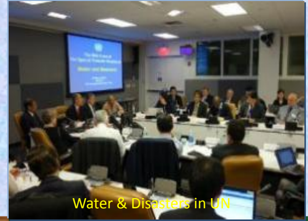
Water & Disasters in UN