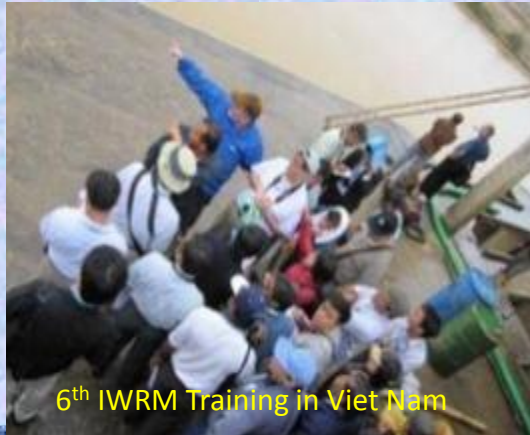
6 th IWRM Training in Viet Nam