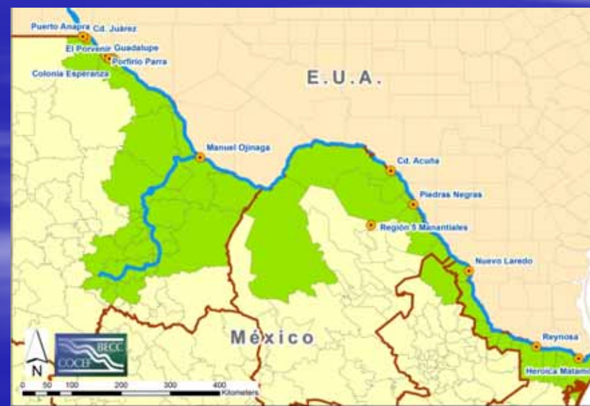
Evolution of Wastewater Treatment Coverage in Mexico along the Rio Grande/Rio Bravo River Bank